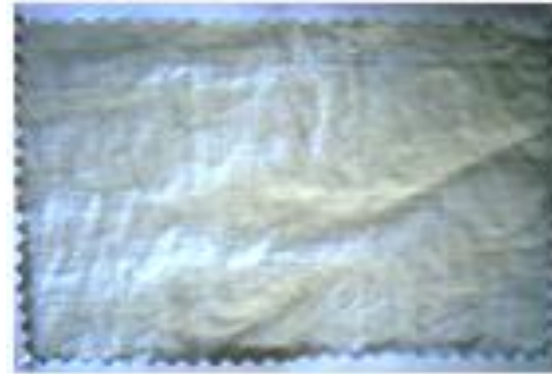
Stab Resistant Fabric from Hi- Modulus Polyethylene (HMPE)