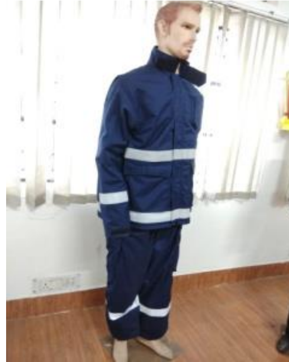
Multi Layered Flame & Thermal Resistance Fabric for Fire Fighter Clothing