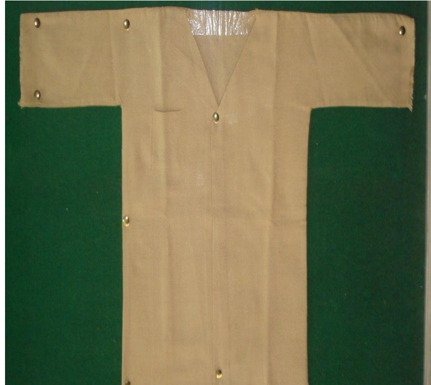
Self Stitched Garment