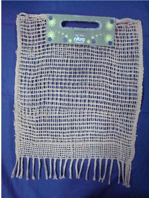
Seamless Jute Carry Bag