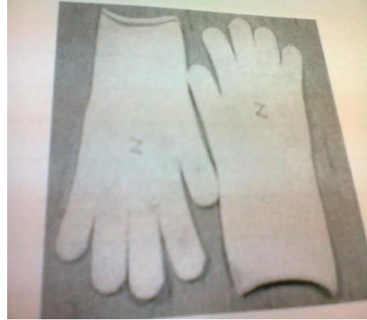
Cut resistant gloves from Nylon / Steel composite Metallic Yarn