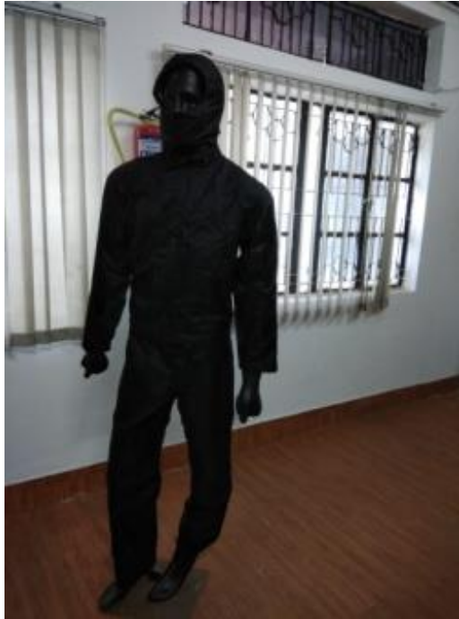
Work wear for Cement Porters