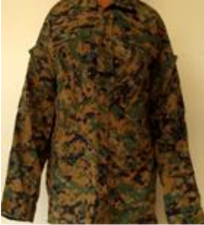
Military & Paramilitary Uniforms from NYCO