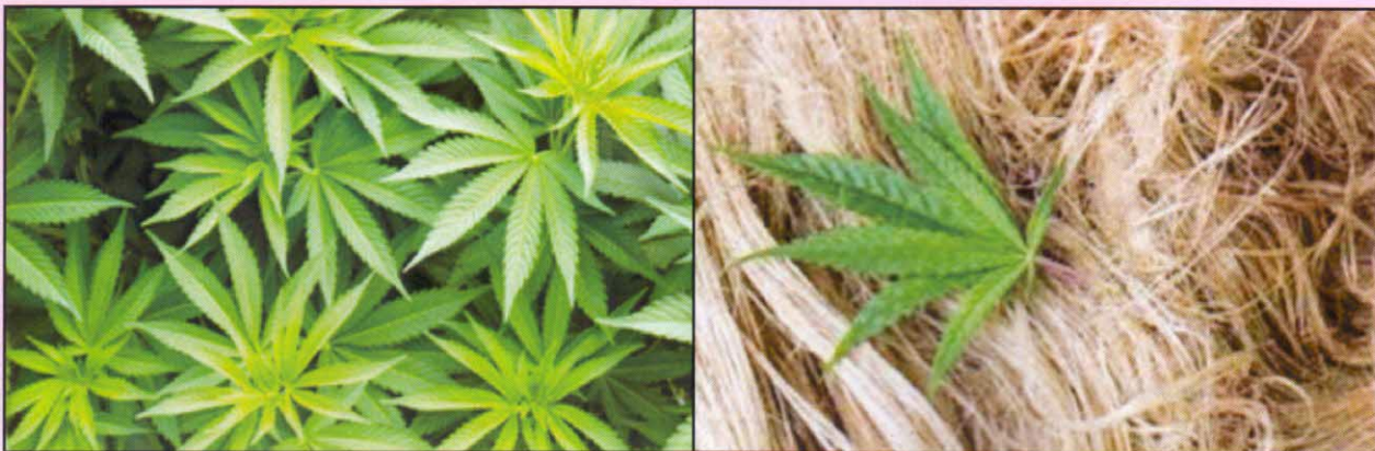
Hemp Leaves and Hemp Fibre

One of the greatest advantages in harvesting of hemp is that it does not exhaust the soil. It leaves the soil in excellent condition for any succeeding crop. Where ever, the ground is appropriate and allows, hemp's strong roots go deep in the ground which enables protection of soil from runoff. It builds and preserves the topsoil and subsoil structures similar to those of forests. Hemp plants shed their leaves all through the growing season, enabling rich natural matter to the topsoil and helping it retain moisture.